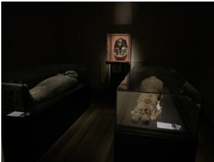
First Floor: Mummy Exhibition