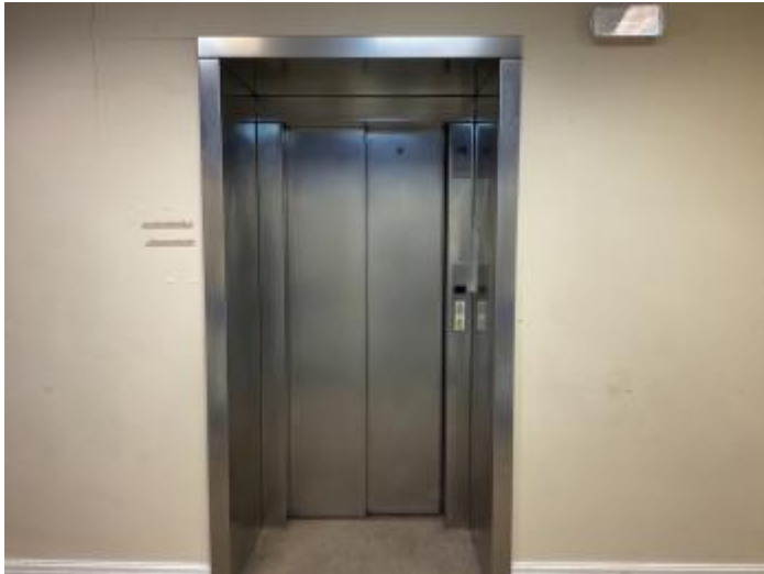
Ground Floor: Passenger Lift