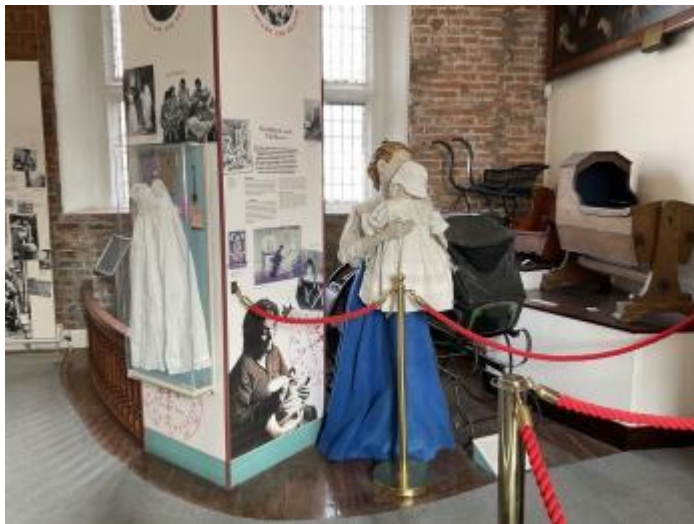
The Story of Hull and its People