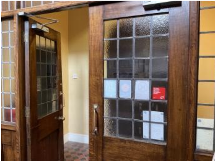
Lobby doors to the Museum