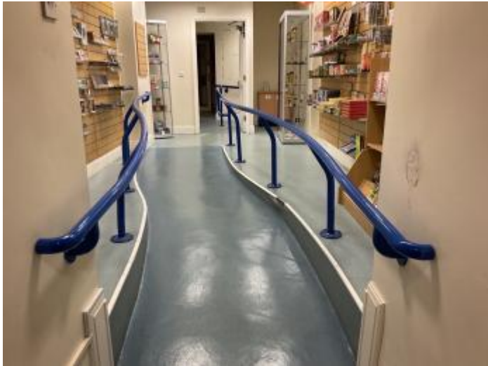
Ramp leading to retail items to the side