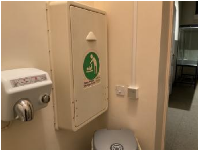
First Floor Baby Changing Unit