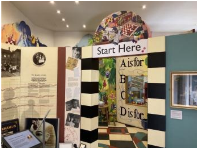
Entrance to The Story of Hull