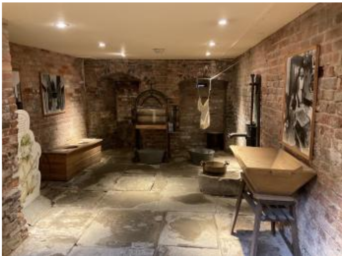
Lower Ground Floor - Victorian Exhibition