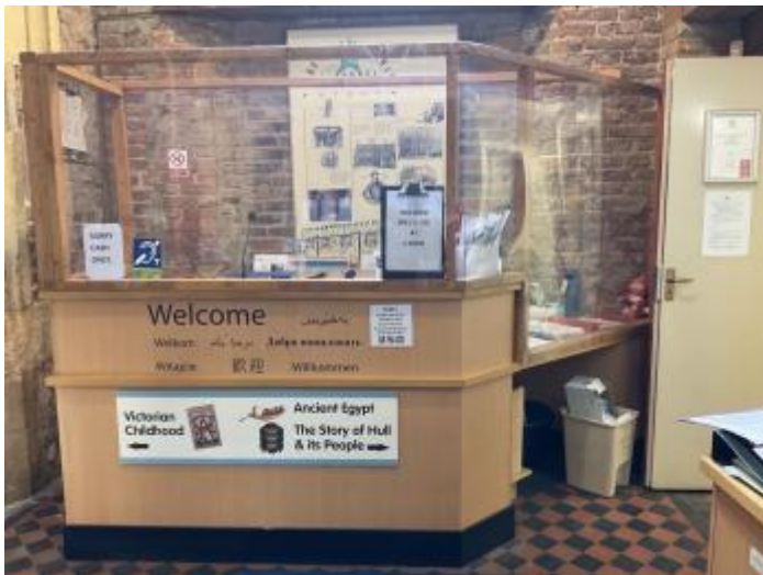
Ticket/ information Desk