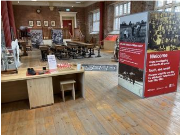
Victorian Childhood Exhibition