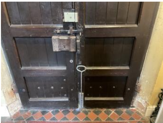
Entrance doors to the Museum