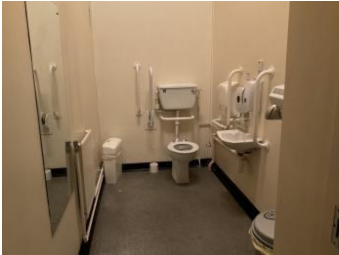
First Floor: Accessible WC