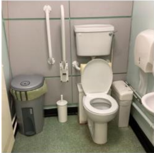
Accessible WC at main entrance reception area