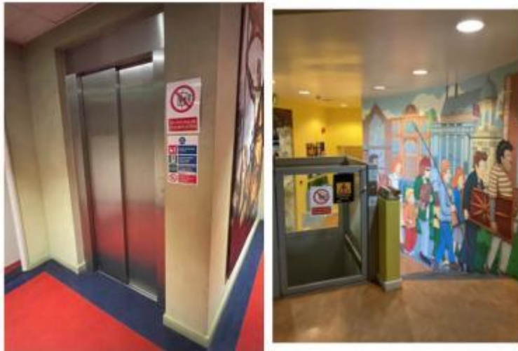
Passenger Lift located near Roman Village Exhibit and Platform lift located near Reception Area