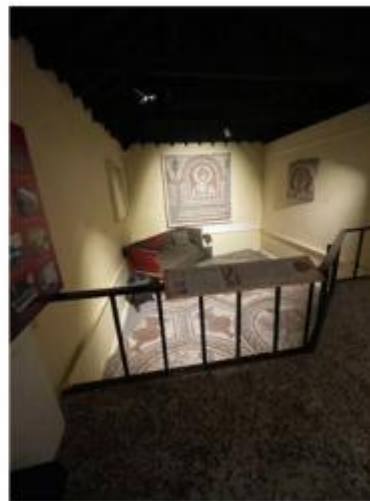
Upper floor roman worlds exhibition