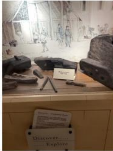
Hull East Riding Upper Floor Medieval gallery