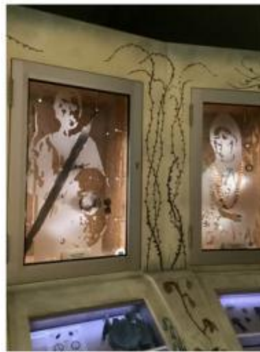
Hull East Riding First Floor Saxon Exhibitions