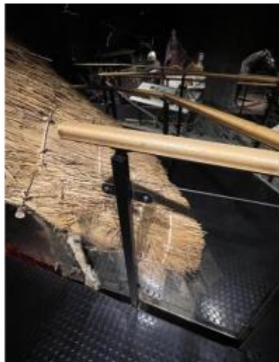
The Prehistoric Man and Celtic Exhibits with low lighting