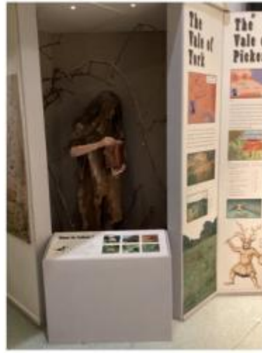
Hull East Riding Ground Floor Prehistoric Man