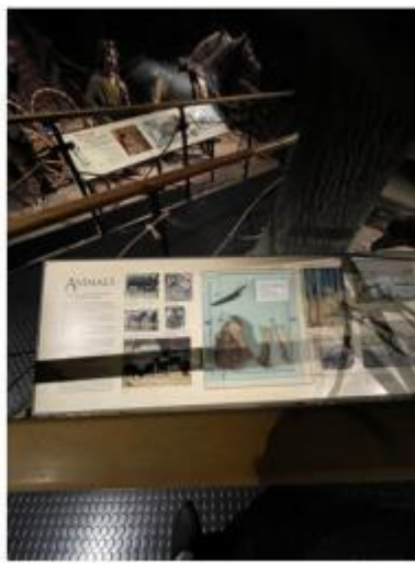
Ground Floor – Celtic Worlds exhibition