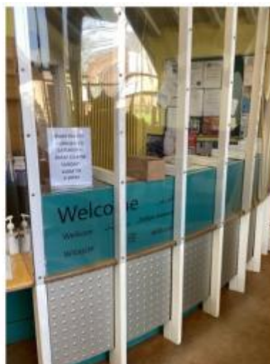
Hull and East Riding Museum main entrance reception information desk.