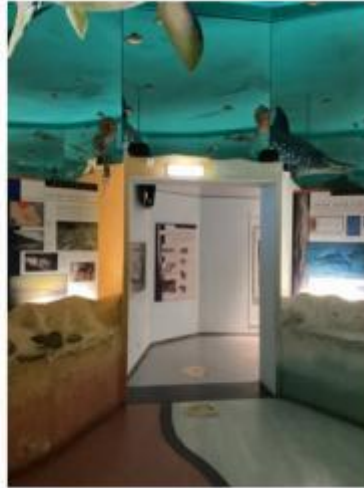
Ground floor fossils and early animals.