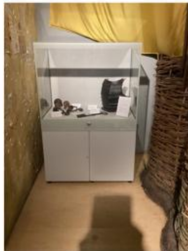
First floor Tudor and Civil War exhibition