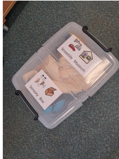
Sensory resource box contents and box