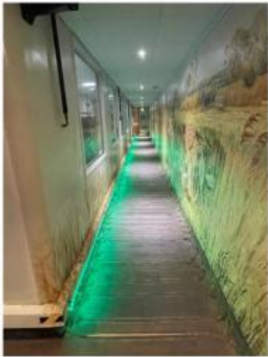
Hull East Riding Museum upper ground floor boat lab