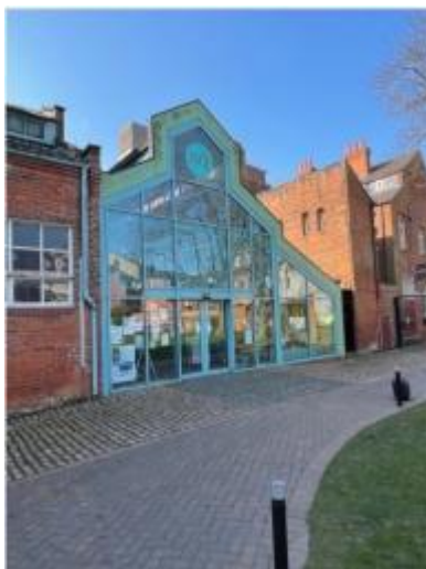
Hull and East Riding Museum entrance