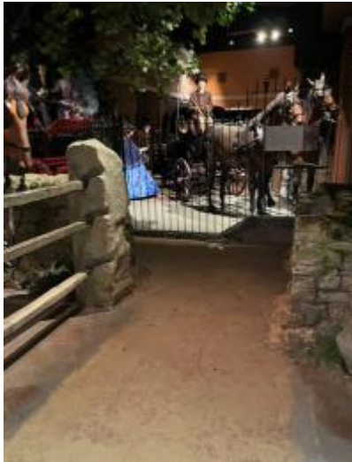
First Floor - The Country Estate