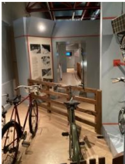
First Floor - The Cycle Gallery