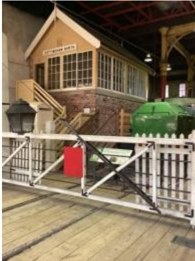
Ground Floor - Railway Gallery - Locomotive and signal box