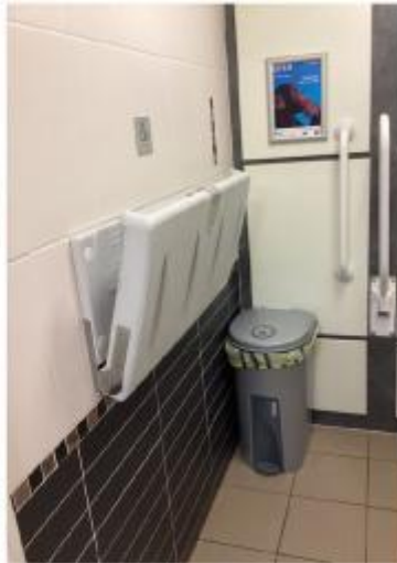
Tram Gallery area Accessible WC