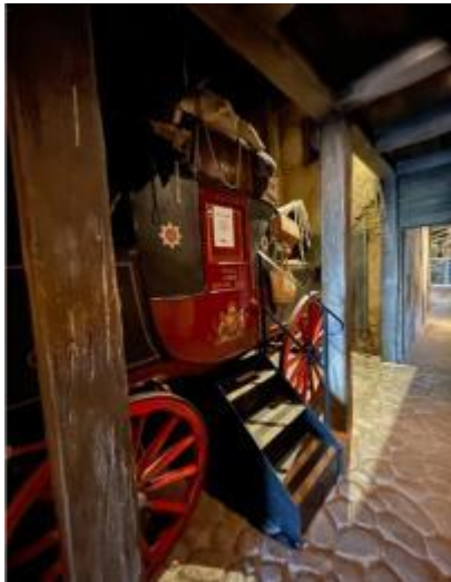
First Floor - The Carriage Gallery