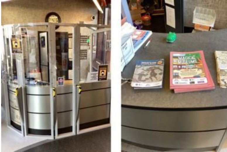
Main entrance reception and information desk