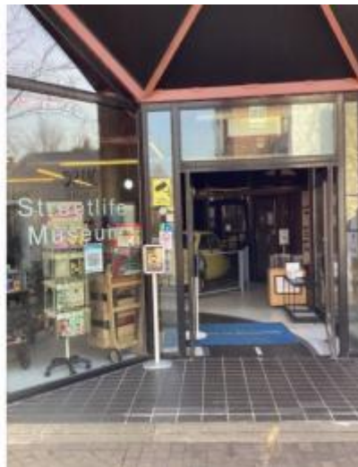
Streetlife museum main entrance