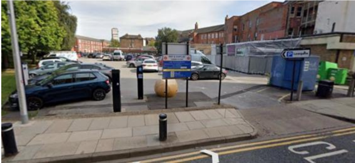
Lowgate car park