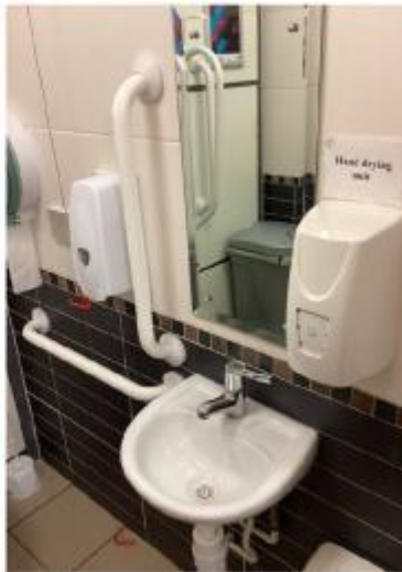
Street Scene Gallery area Accessible WC