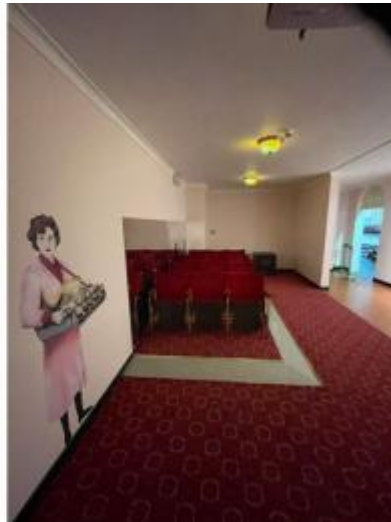
Ground Floor - The tour – Cinema