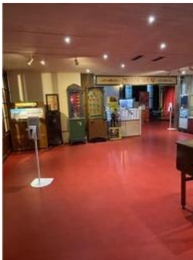
Ground Floor - Car Gallery - Arcade Games