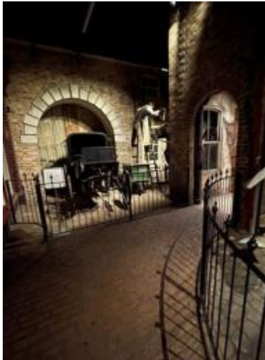
Low lighting in the Carriage gallery