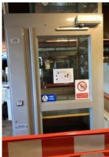
Platform lift in Tram gallery