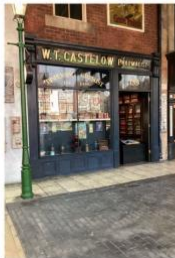
Ground Floor – Street Scene and Arcade