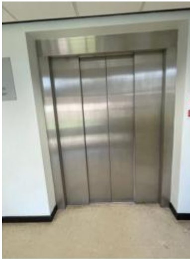
Main passenger lift